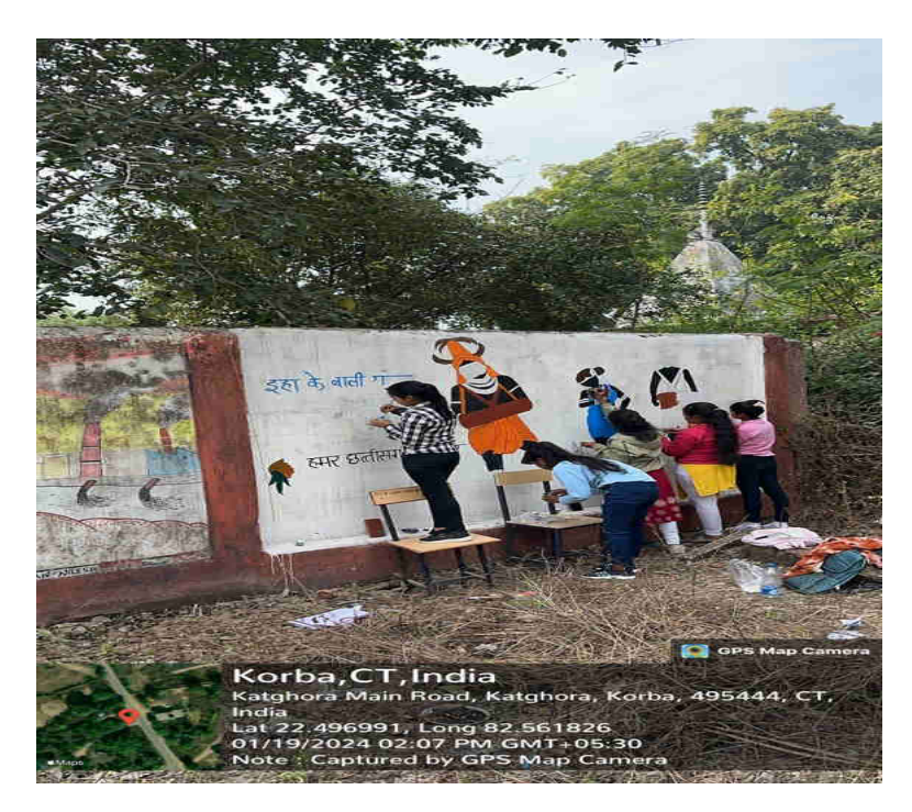
प्राचार्य भा.मुकुटघर पंडिय महाविद्यालय कटघोरा (छ. ग.)